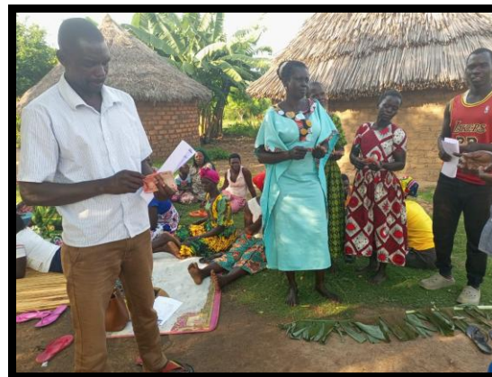
November 2025 loans for the Atiiri Makole group

Unfortunately, the collaboration with GlobalGiving from the United States has come to nothing. The plan now is to focus on training girls at the 10 schools that HADEO works with, to make reusable sanitary pads. The total budget is 30,000 euro, of which we have now acquired 5,000 euro.