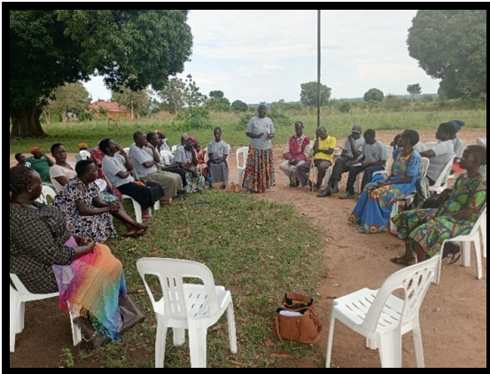
meeting on sex education in Akubui

The NGO HADEO (Hope Again Development Organization) from Uganda is supported by HADEFO (Hope Again Development Foundation). Our common goal is: To fight poverty through education, loans and projects for adults in Soroti and Ngora district, located in Eastern Uganda.