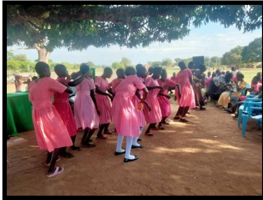
performance on sex education by students Kobwin Primary School

Hadefo has found administration office Woldendorp from Bedum willing to prepare the annual accounts free of charge. Since January 1, 2009, Hadefo is an ANBI. An agreement with Hadefo in which you record your annual donation for five years, has tax advantages.